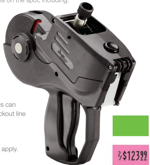
Monarch® 1156® One-Line Promotional Labeler

Complete warranty and other terms and conditions are available upon request.