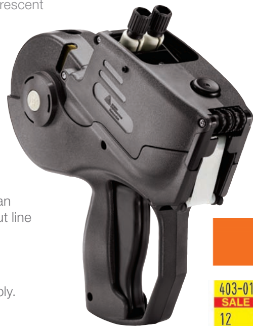
Monarch® 1155® Two-Line Labeler

*Drop-tested up to 192 times from a distance of 3-5 feet onto a concrete floor without damage.