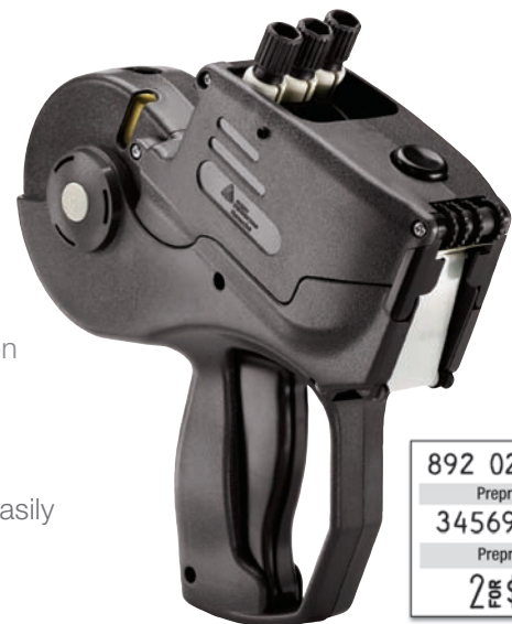
Monarch® 1153® Three-Line Labeler

Complete warranty and other terms and conditions are available upon request.