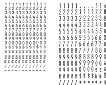
Top and Middle Lines