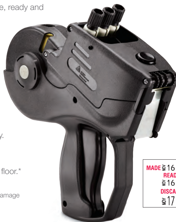
Monarch® 1153® Three-Line Labeler

Complete warranty and other terms and conditions are available upon request.